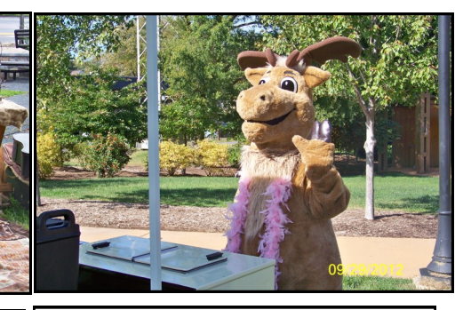
The Caribou Coffee guy