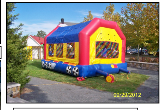
Kid's Moon Bounce