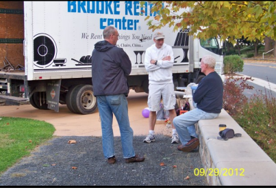
Club Members Waiting to Work